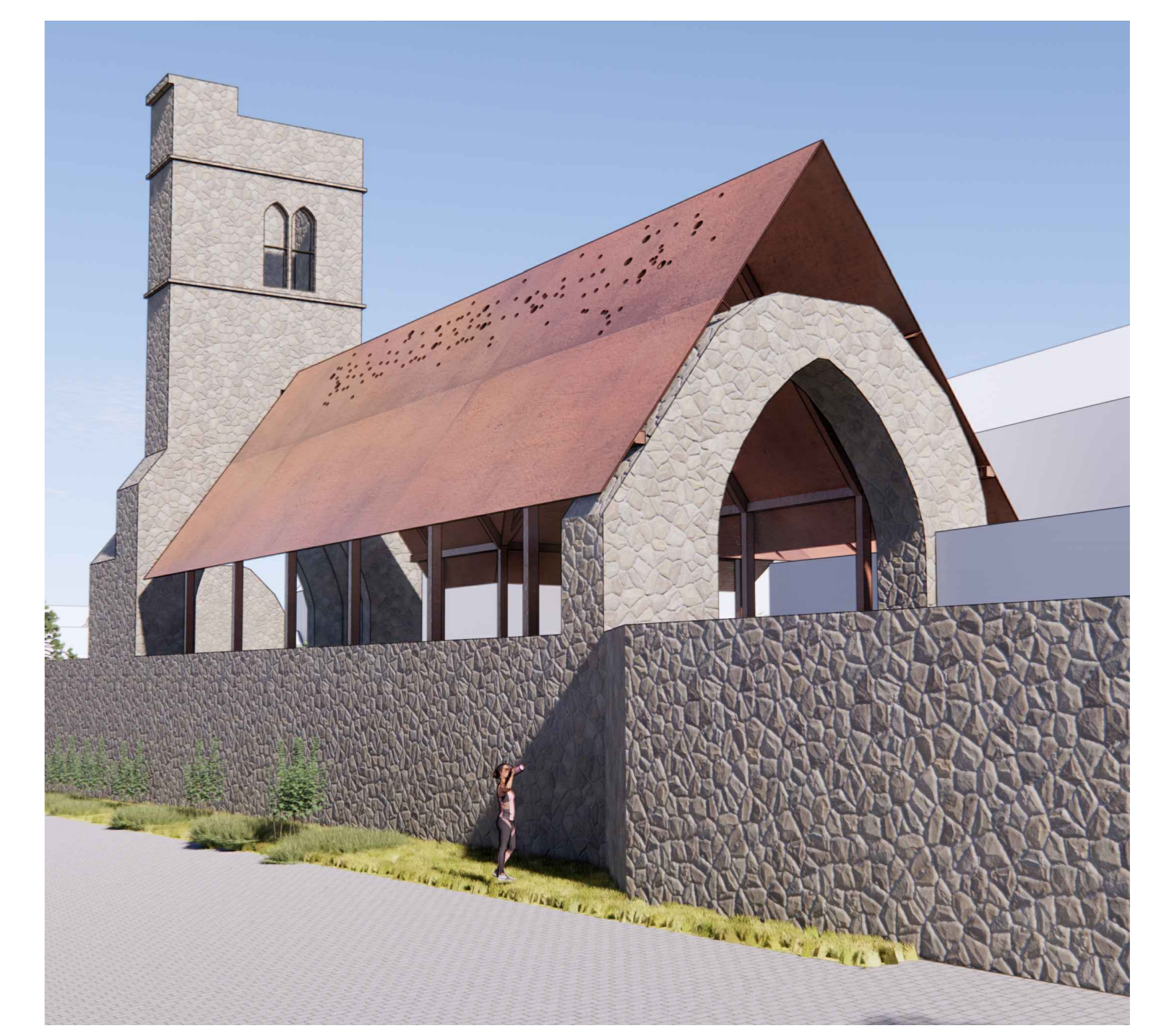
VIEW FROM SOUTH-EAST